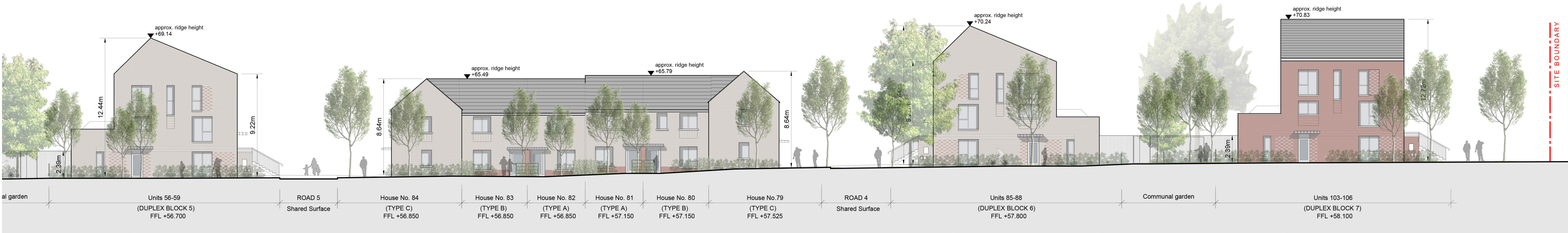
SECTION A-A CONTINUED