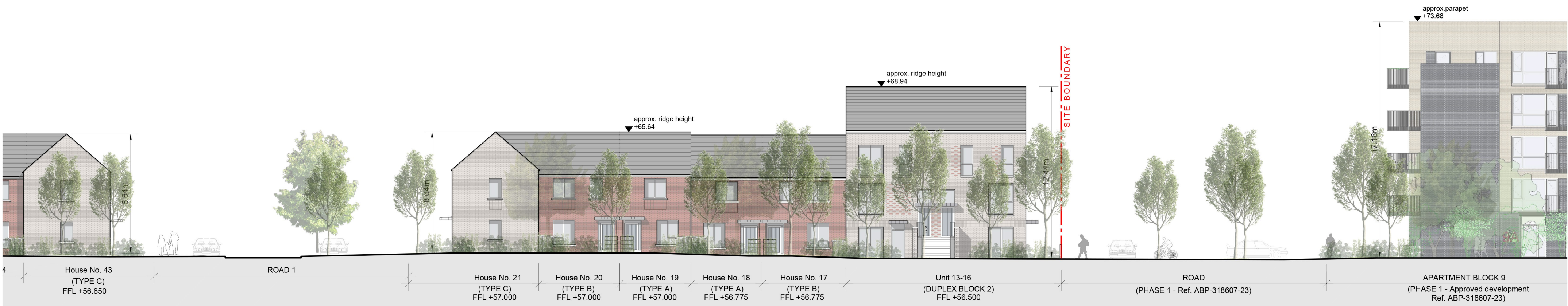
SECTION B-B CONTINUED